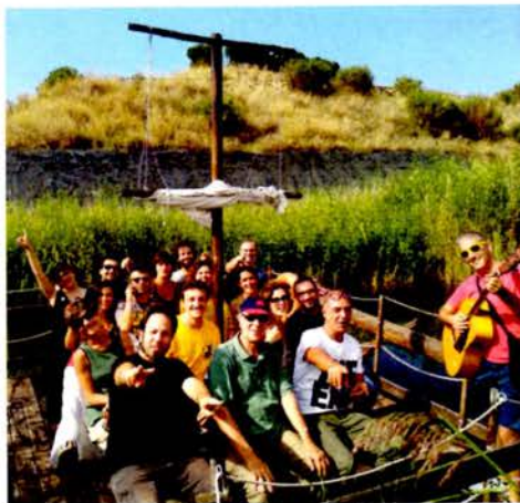
Foundation meeting of Rete OSI Sud

The Northern OSI Network has already organized an event based on an extremely interesting organizational concept: the OSI DAY. On the same day (April 21 st 2018) 11 of the 17 Associations of the Network organized a Schulwerk activity on the 'terzo settore' exchanging the teachers (be it a workshop, a seminar, an exposition, a demonstrative lesson, etc... a couple of times involving conservatories or universities). This way the relationship-collaboration between the participating associations has been one of concreteness, mutual knowledge and actual exchange of experiences. The OSI DAY involved on the whole over 200 attendees, collected 60 new members for OSI and diffused over 60 volumes of our Didactic Collection.