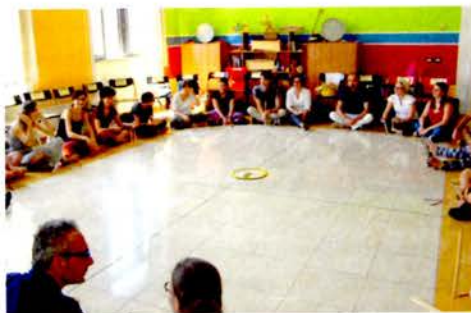
Foundation meeting of Rete OSI Nord

However, before these undeniable attractions, there is one special skill which we consider to be fundamental: the ability to “listen”. To listen to people, to the territory, to the desires, to the needs and to the suggestions (it is not a way to do “marketing”, it is instead a way to spread a pedagogical-musical line